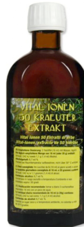
Vital Ionen 50 - Kräuterextrakt