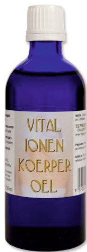
Vital Ionen Körperöl