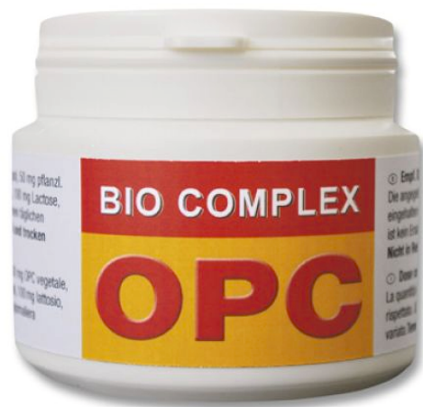
OPC Bio Complex