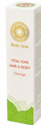
Vital Ionen Hair and Body