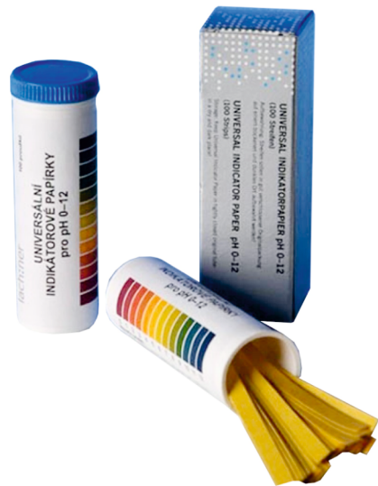
PH indication papers