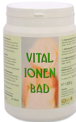
Vital Ionen Bad